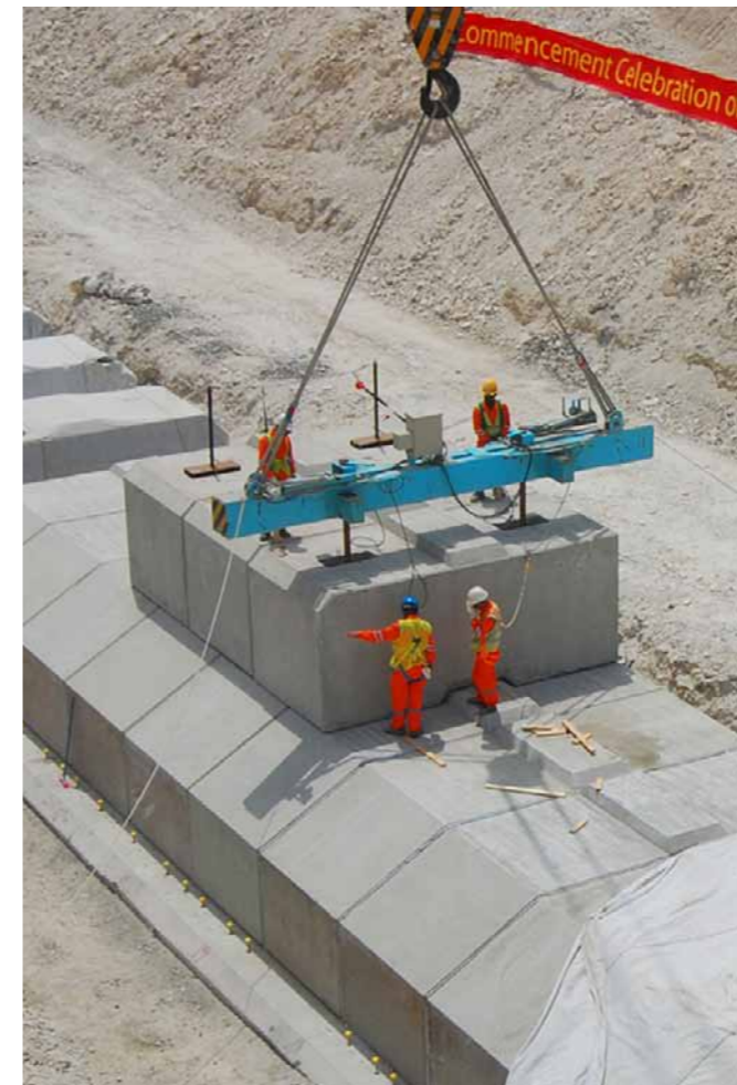
First quay wall block installed

The first phase of the project is expected to be completed in 2016, and future phases will become operational as the need arises. Forecasts suggest that Qatar's economy will