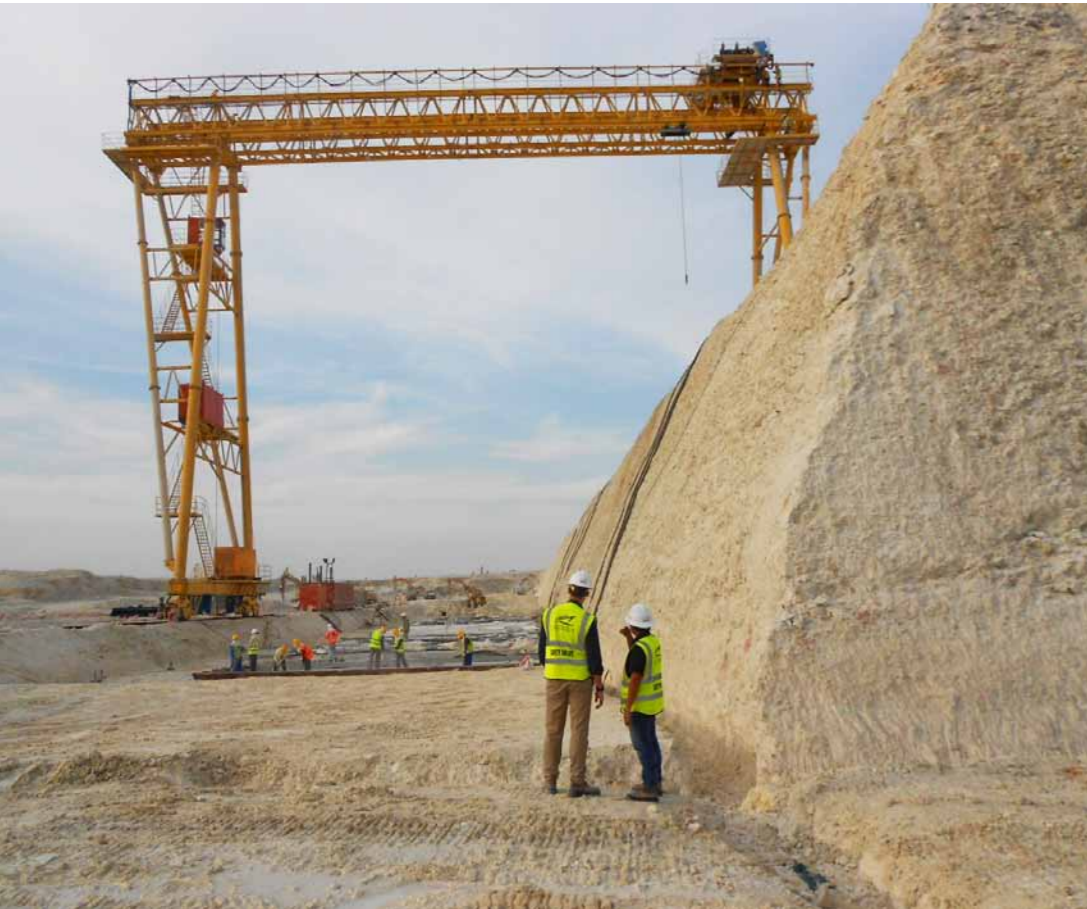
Container terminal gantry crane